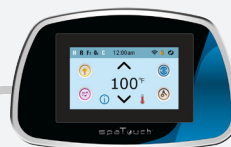
Topside Panel: spaTouch 2 Graphical User Interface: "Icon" (software version 2.0 or above)