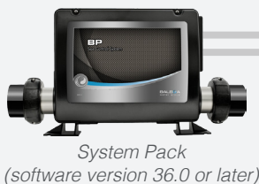
System Pack (software version 36.0 or later)

The power supply connects to the system pack at the circuit board connector labeled "A / V." Refer to the system pack wire diagram for circuit board connector positions. The wire diagram is inside the system pack.