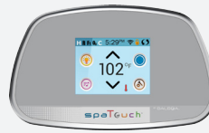
Topside Panel: spaTouch 1 Graphical User Interface: "Icon" (software version 3.36 or above)