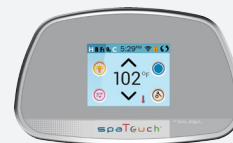
Topside Panel: spaTouch 1 Graphical User Interface: "Icon" (software version 3.36 or above)