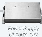
Power Supply UL1563, 12V