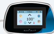
Topside Panel: spaTouch 2 Graphical User Interface: "Icon" (software version 2.0 or above)