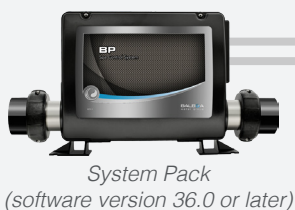
System Pack (software version 36.0 or later)

The power supply connects to the system pack at the circuit board connector labeled "A / V." Refer to the system pack wire diagram for circuit board connector positions. The wire diagram is inside the system pack.